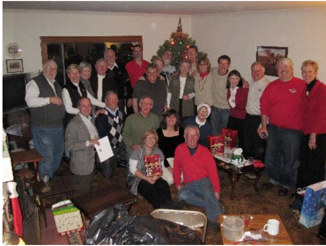
Not intimidated by the weather