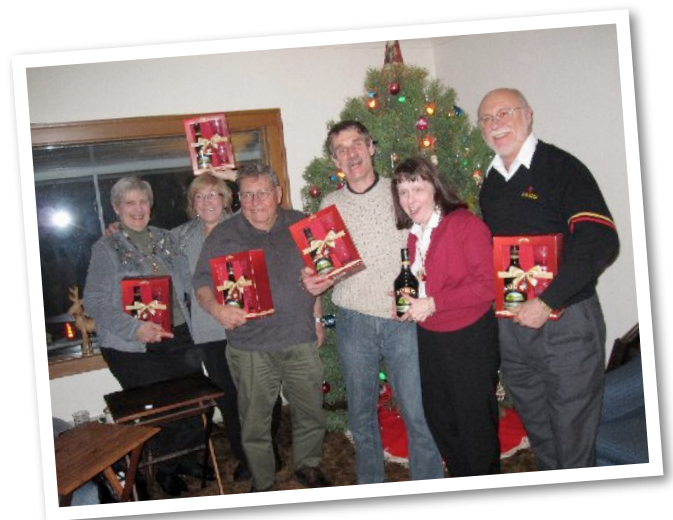
These smiling people ended up with the Baileys!