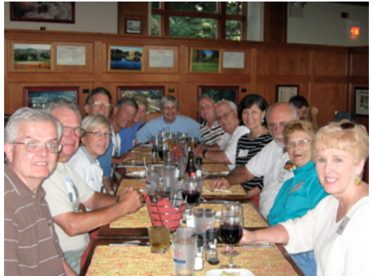
Photos from HealeyFest 2008, held at Eagle Ridge, Galellna, Illinois